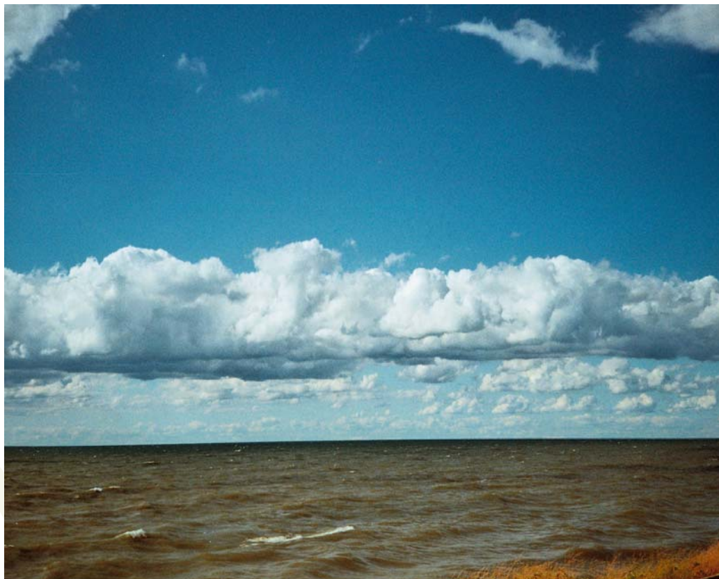
Creating Heaven on Earth One Person at a Time

216.261.0181 raven@stresswizardcoaching.com www.stresswizardcoaching.com